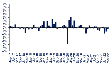
Monthly Returns during the Last 5 Year